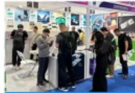
Guangzhou International Electronics